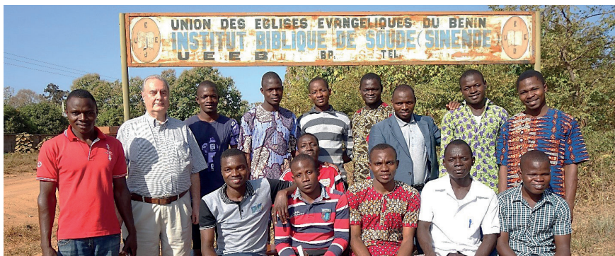
Growing church leaders in Benin