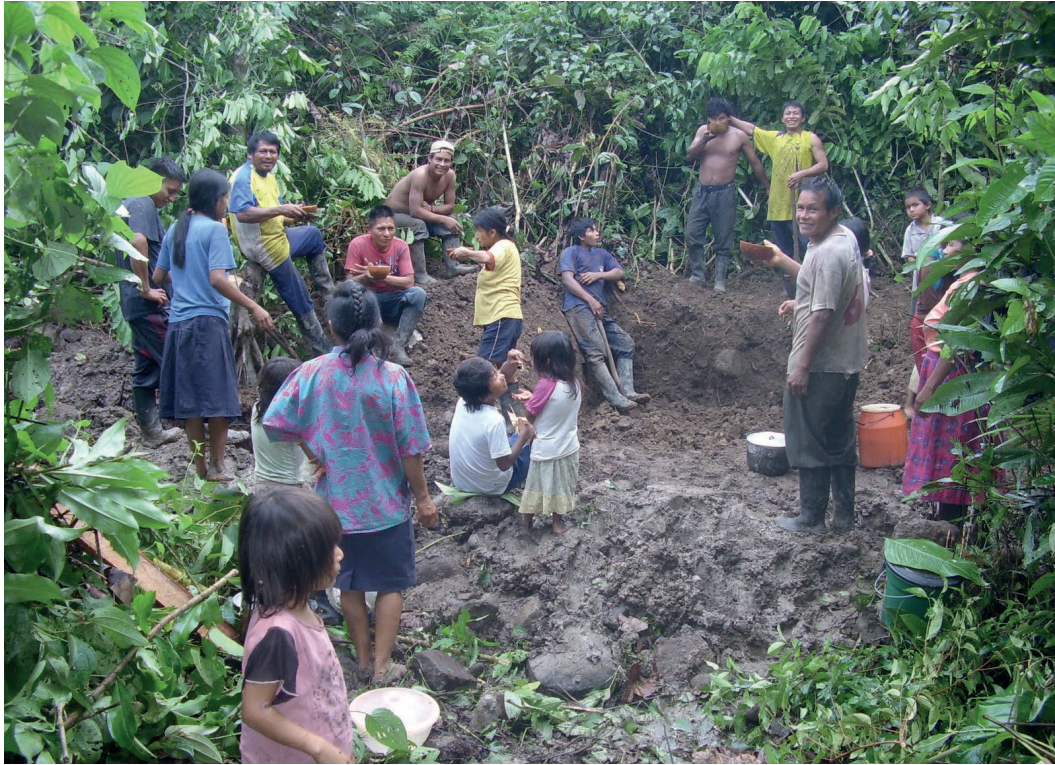
Digging a water trench