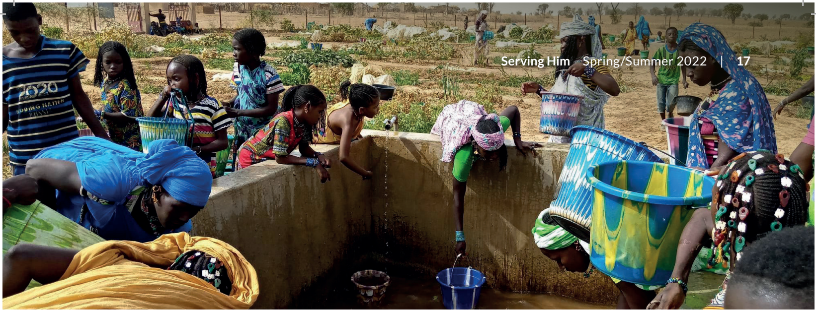
The Faithful Witness team launched a water project in two villages with support from the Nomadic People's Network