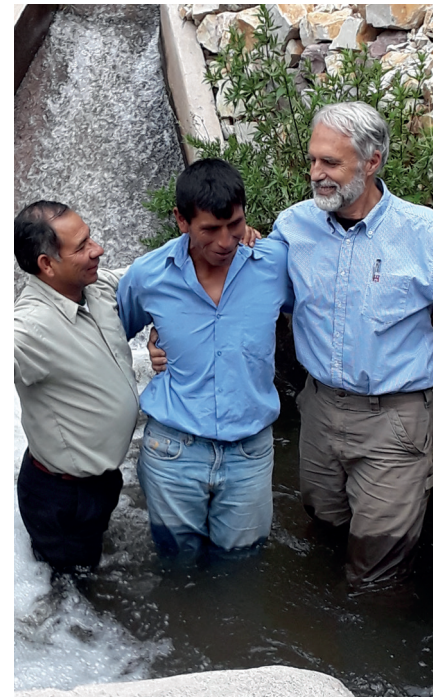
New believers baptised in rural Peru – your gifts enabled mission workers to reach this community

Keen-eyed regular readers will spot that there is no tear-off donation flap in this new magazine! It is a lot more efficient and cost-effective for us to process donations digitally through the website, directly from your banks (like standing orders or direct debits) or over the phone. However, we are still accepting cheques by post, although they will take longer to be processed.