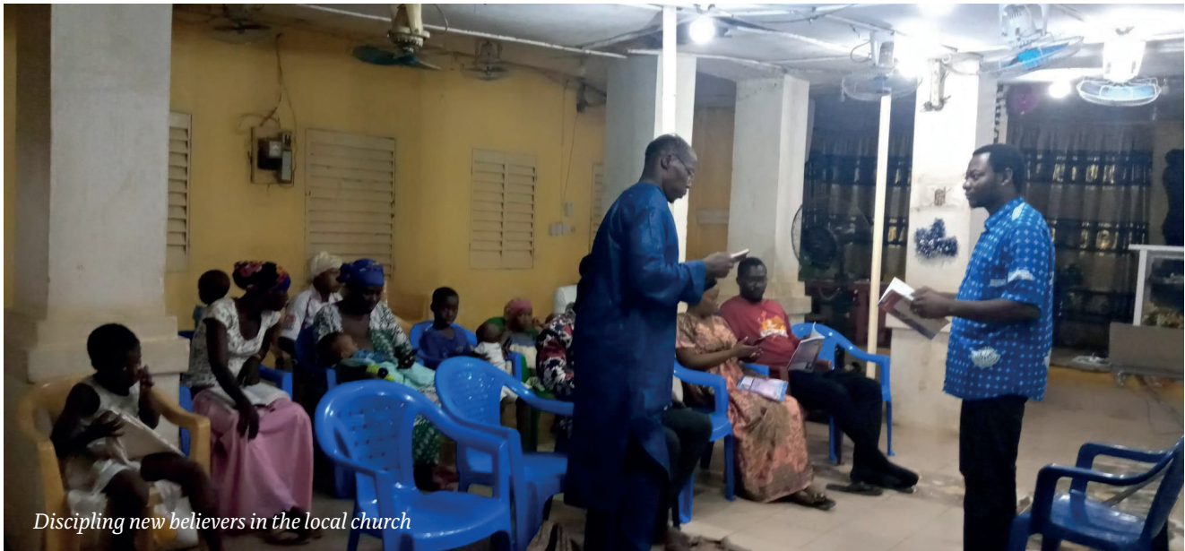
Discipling new believers in the local church